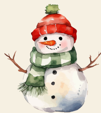
Xmas Cards raised £119