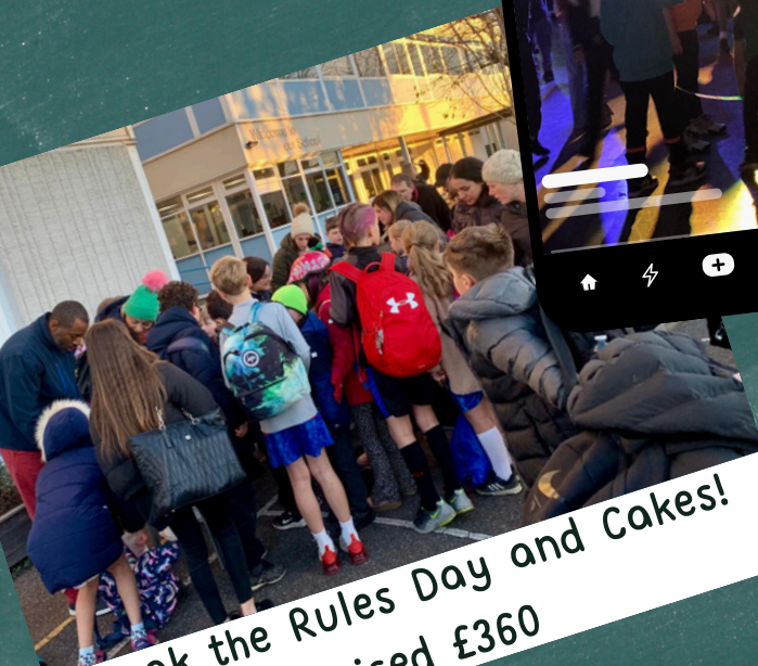
Break the Rules Day and Cakes! Raised £360