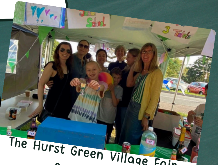
The Hurst Green Village Fair. Raised £368